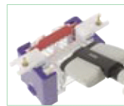
gel loading guides