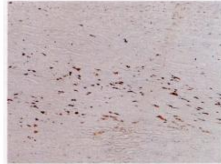
Immunohistochemical staining of the early stage of human atherosclerotic lesions of the aorta with anti-AGEs antibody 6D12.

Clinical nephrology , Vol.42, 354-361, 1994